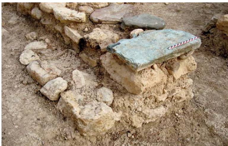
Figure 3. The southeast corner of House Tomb 2 at Petras showing the bench at the eastern end of the south side and the green chlorite schist slab used as a sill for the doorframe at the entrance to Room 8. The scale on the door sill is 20 cm long.