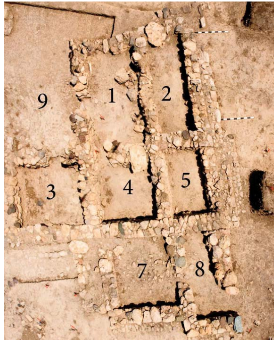
Figure 1. Aerial photograph of House Tomb 2 at Petras.

A comparison between House Tomb 2 and the much smaller Mochlos Tomb IV-V-VI reveals how the Petras funerary architecture fits within the tradition of Minoan house tombs (Fig. 2). In both cases, the human bones were placed in these ossuaries after the flesh had decomposed. Both buildings stood above ground, and both had one room with an open side that faced toward an open court as well as closed spaces. In both cases, some of the rooms had