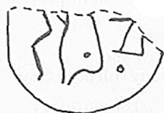
Fig. 2. The fragmentary medallion PE He 4:

als or ideograms. Varying numbers of dots, each probably indicating the numeral 10 (Fig. 2) are furthermore found on the reverse of six medallions. The system used thus appears to be sign-groups on side .a and numerals on side .b. For this system there exists one certain parallel at Knossos (KN He (04) 03). None of the sign-groups appears with certainty to be attested previously.